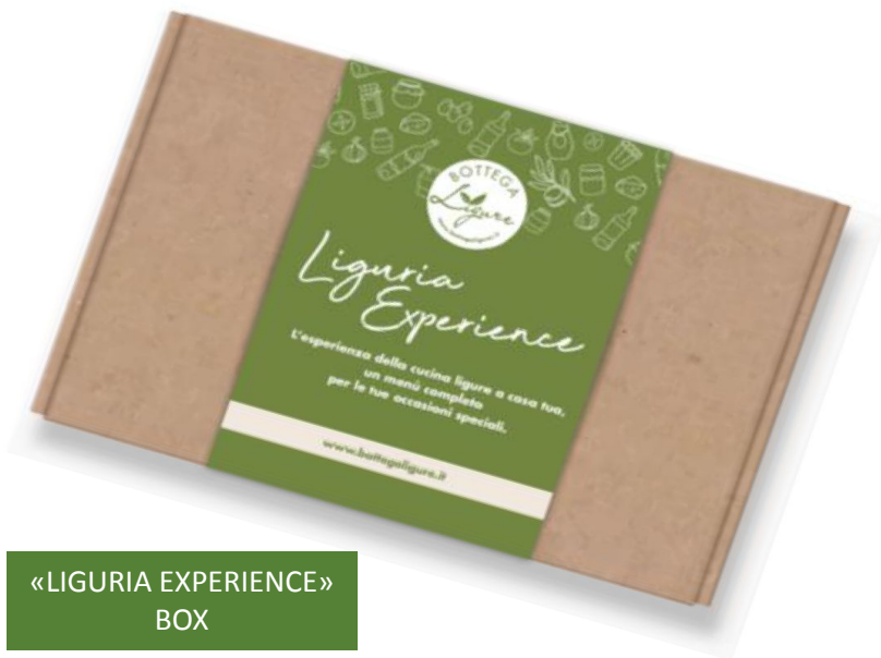
«LIGURIA EXPERIENCE» BOX

WE CAN HELP YOU BUILD YOUR OWN FOOD AND WINE GOURMET PROPOSAL!