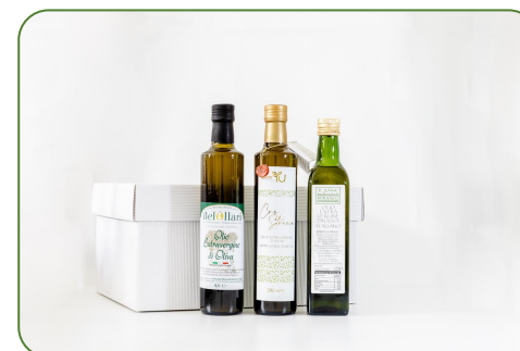
GOLD SELECTION - E.V. OLIVE OIL