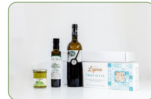
A TYPICAL DINNER «MADE IN LIGURIA»